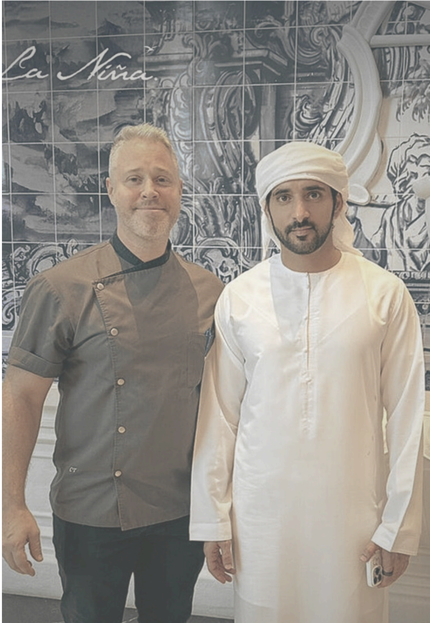
"Honored to welcome His Highness Sheikh Hamdan bin Rashid Al Maktoum, Crown Prince of Dubai, at La Niña"