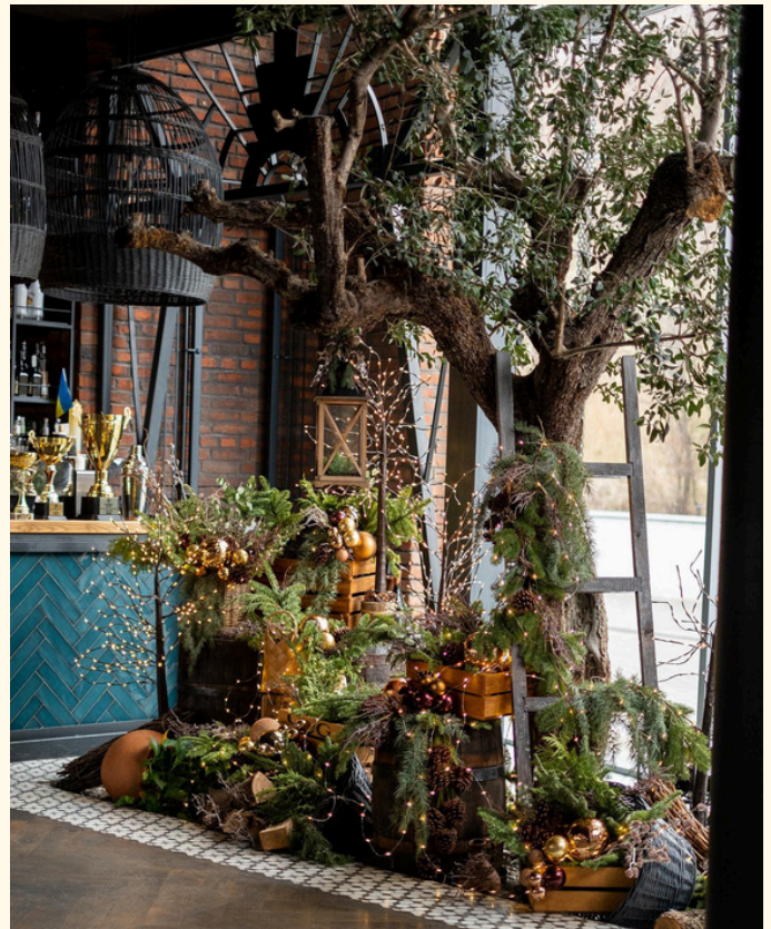
Most of the filling of the object is furniture, decor, lighting, designed specifically for this project.