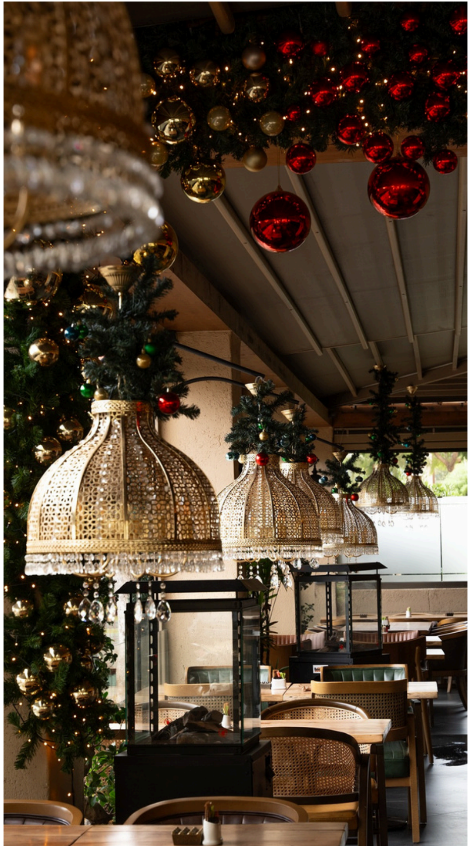
Crafting the Grandeur of Opera Grande