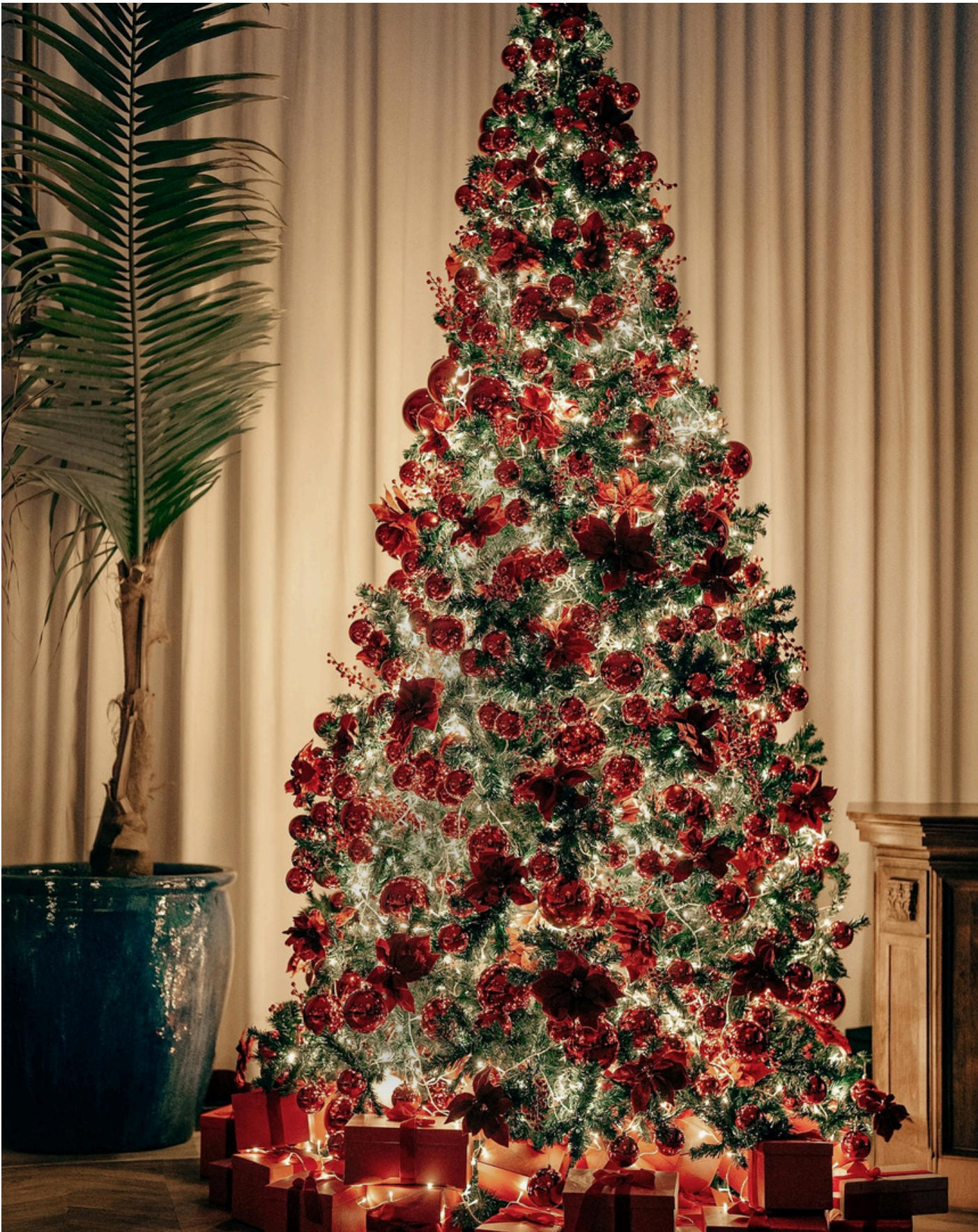
LA NINA, DUBAI